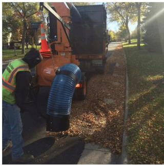
A common leaf machine

As the summer comes to an end, the temperatures drop, severe storms dwindle and the evenings grow dark sooner, a new challenge arrives for our stormwater system. We strive to keep all of you up to date on our daily and monthly activities, but sometimes when we share our documents, there are science-heavy sections that become confusing without further explanation. One major focus of the Stormwater Authority is to remove as much sediment and nutrients as possible from our system to meet regulatory requirements and protect our water bodies. The approach of autumn brings falling leaves and therefore a great influx of nutrients, specifically phosphorus and nitrogen that make up organic leaf material. If we fail to capture enough leaf debris, eutrophication may occur. Eutrophication is the scientific term for the overabundance of nutrients in a water body, which leads to an increase of plant and algae growth. This type of overgrowth can create algal blooms, dead zones, and fish kills, all of which are events that take a long time to recover from (NOAA).