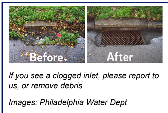
If you see a clogged inlet, please report to us, or remove debris

What can we do? The most important way to stay safe during severe weather is to stay informed. Watch out for dark clouds, check your local weather, and create a safety plan. You might notice Stormwater and Highway staff making their way around the Township before a storm too – we check on drainage in low lying areas and keep an eye out for clogged inlets. Clearing out inlets and swales allows rushing rainwater to drain from the road faster and possibly lowering the impact of a flash flood. If you see a clogged inlet or flooding, please report it to the Stormwater Authority to allow for inspection and repair.